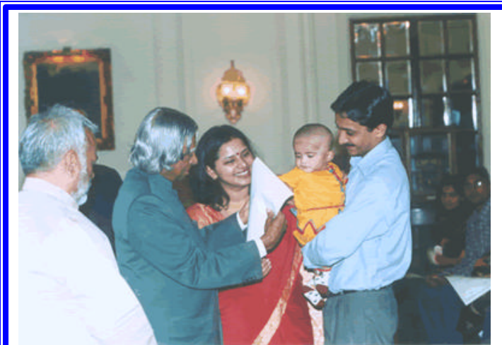
The Honourable President of India, Dr A P J Abdul Kalam launching the National Campaign on Birth Certificates on 14 th November 2003 at a solemn function at Rashtrapati Bhawan, New Delhi

It is the right of every child born in the country to have its birth registered and provided with a birth certificate free of charge. It is compulsory to register all births and deaths under the provisions of the Registration of Births and Deaths Act, 1969. However, only about 38,000 out of the estimates 70,000 births that occur in the country everyday are entered into the birth registers maintained by the Registrar of Births and Deaths. Unfortunately only in small proportion of such cases the birth certificates are issued as per the provision of the Act. There is tremendous scope of improvement in this service of delivery of birth certificate to every child born in India.